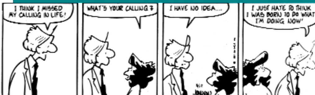
ARLO & JANIS reprinted by permission of Newspaper Enterprise Association, Inc.

"When we are very young, work is largely a matter of how to find bread to eat, and clothes to wear, and how to put a roof over our head. But as we move through the various stages of our life, our work becomes increasingly a matter also of how our soul lives out its dreams...And, through each of our work choices during our lifetime, we increasingly find ourselves looking for the work we feel we were born to do." —Bolles, Your Parachute , p. 155